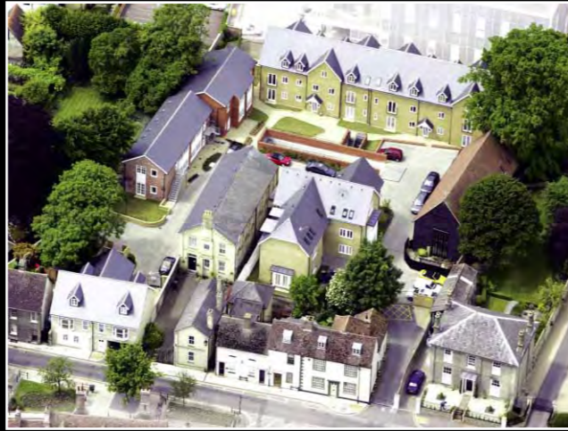
Stamford Yard, Royston