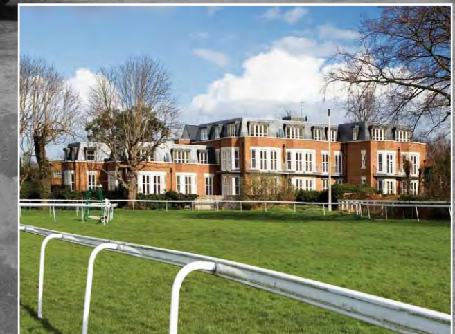
Cheltonian Park, Portsmouth Road, Esher