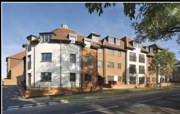
The Heights, Letchworth

Furthermore we possess an in depth knowledge of Housing Association requirements.